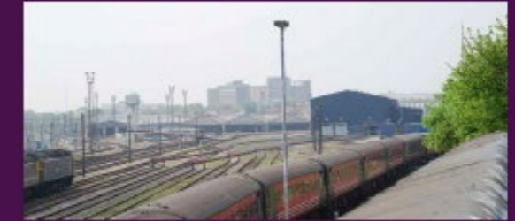
rail sidings at old oak