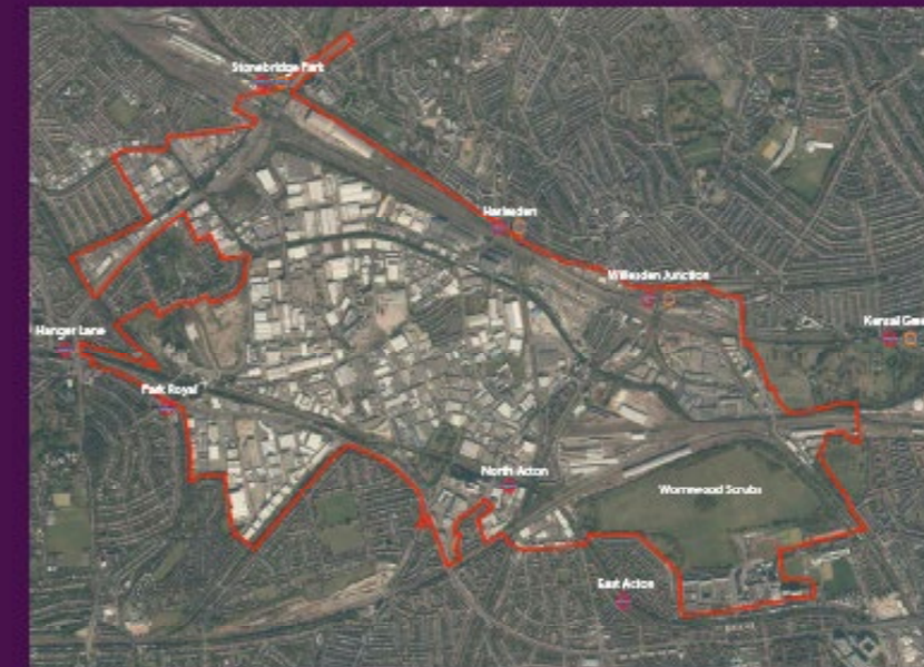
proposed boundary of mayoral development corporation