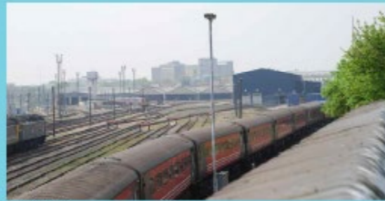
rail storage at old oak

This public consultation will run from 5 November until 5pm on 26 November 2014.